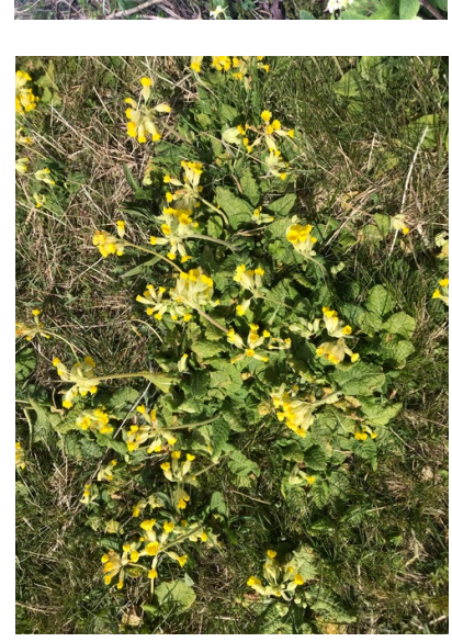
Cowslips on Winkelbury Hill