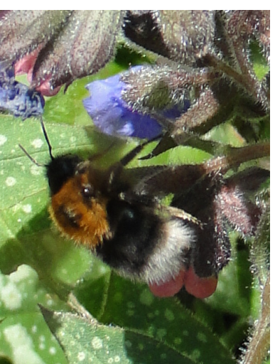
Bombus hypnorum or tree bumblebee Linda Smith