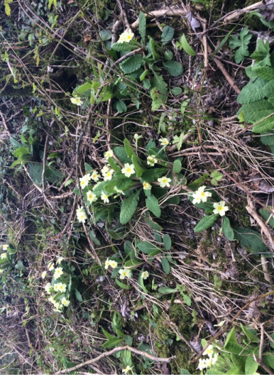
Primroses on the way to the Ox Drove