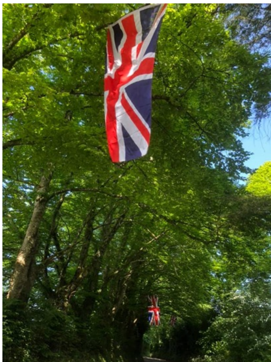
Welcome to Berwick! Louise Hall