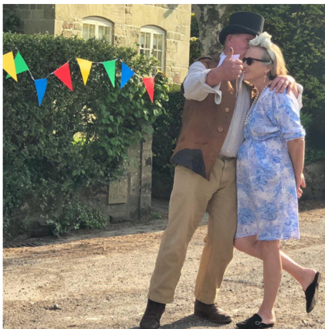
VE Day Romance. By Grethe Wimbush