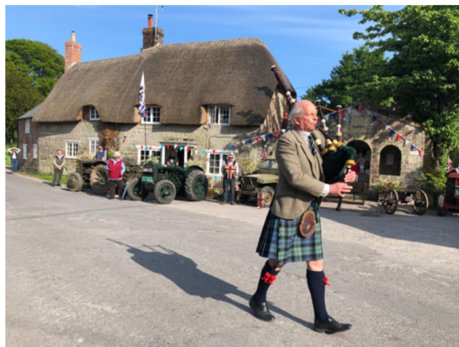
Alastair Campbell By Grethe Wimbush