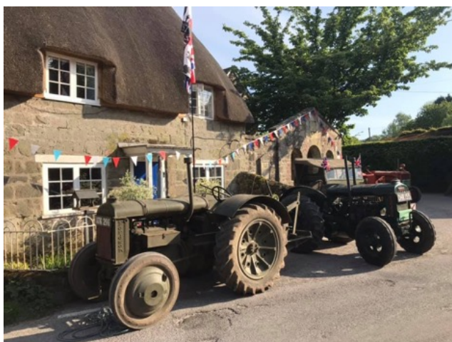
Tractors on the Cross